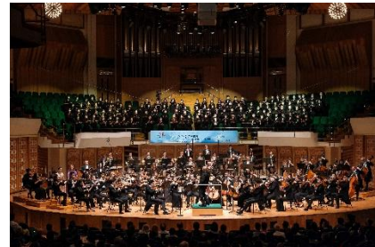
Hong Kong Philharmonic Orchestra